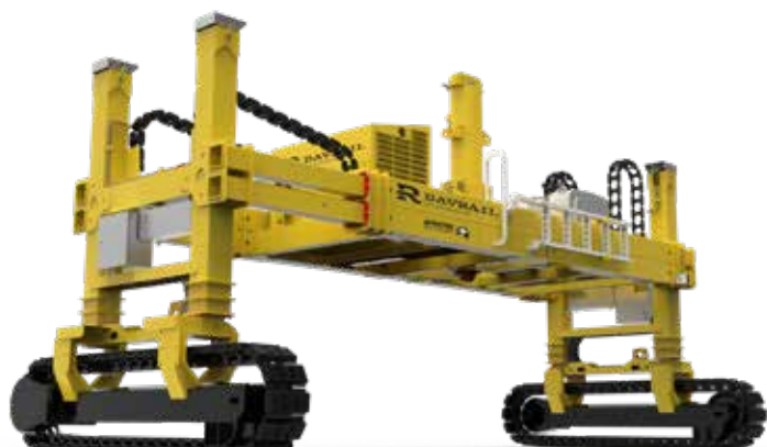
4 Point Quadlift "H" Beam