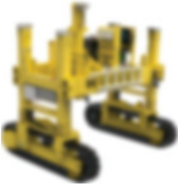
CHARLIE (coming soon)